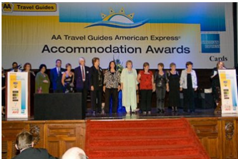
We were contributing sponsors at the AA Travel Accommodation Awards Dinner During Indaba