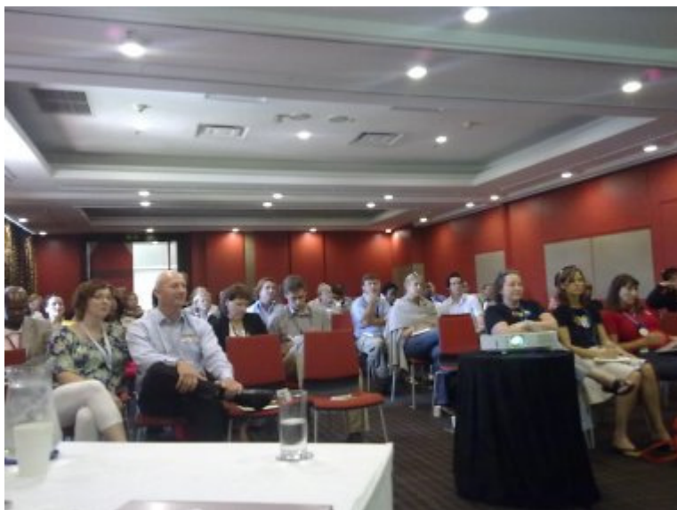
Tourism Indaba ICC Durban : Delegates at our Greenstuff breakaway workshop "How to Go Green"