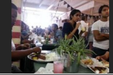
Sights, smells and every kind of organic food you can imagine. Fair Trade tea, raw chocolate, craft beers; you name it.