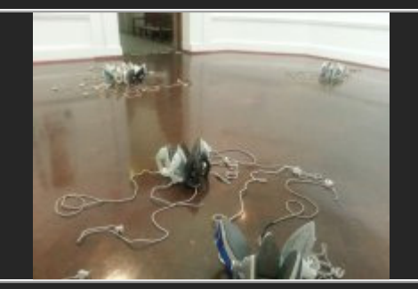
More... Irons. Well?