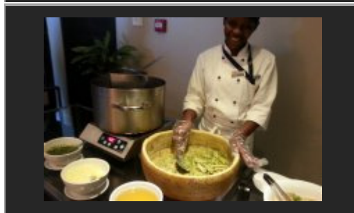
Radisson Blu excels once again with great food; pasta mixed in parmesan shell.