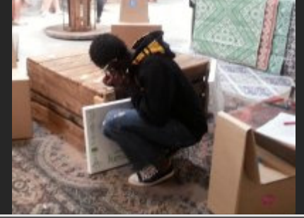
Young man making chairs and children's furniture from old cardboard boxes. Will be adding him to website.