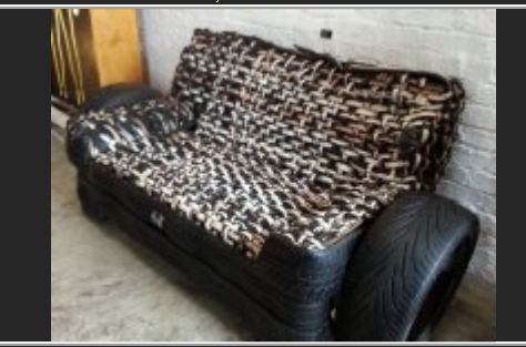
Arts on Main in the Maboneng Precinct. Found this couch woven from recycled car tyres in one of the