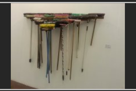
Rediscovering Jo'burg finds us at Johannesburg Art Gallery. Nice surprise to see recycled art. Brooms.