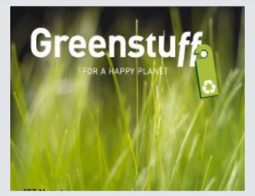
Eco-friendly products for the hospitality industry.