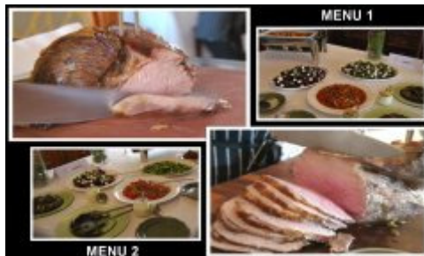
Table 1 and Table 2. Identically cooked dishes using organic vs industrial meat and vegetables. We had to guess which was which.