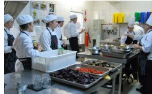
Hectic activity and strict guidelines for the student chefs busy in the kitchen.