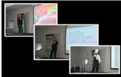
We had 8 speakers covering introduction to Slow Food, organic meat, fish farming, genetic engineering, Bokashi for waste, green kitchens, Fair Trade, climate change and more.