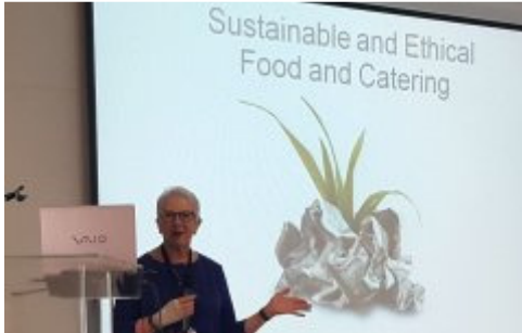
Presentations in the beautiful, state of the art auditorium at Prue Leith Chefs Academy.

After doing all the sums, we worked out that the ORGANIC food that finally ended up on our plates, cost R12.00 LESS per plate than the industrial food... something we have always suspected! No more excuses.