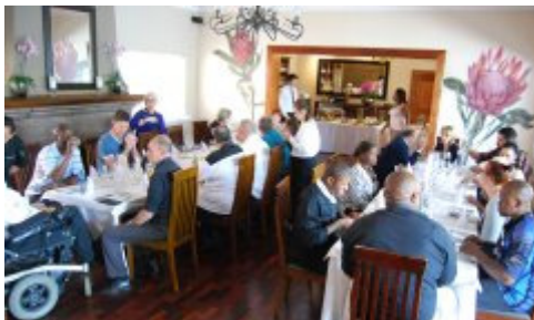
Some of the 80 attendees taste and discuss the dishes.