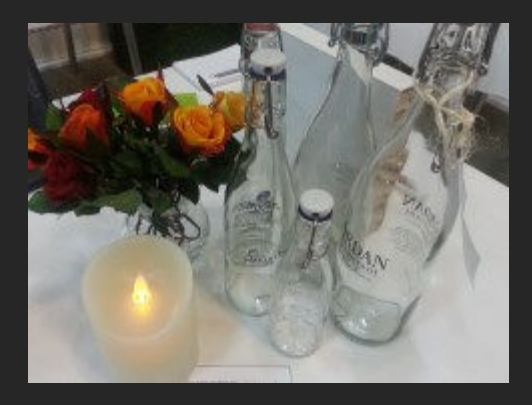
Silk flowers, swing top glass bottles, candle with LED light, recycled paper table top with chemical free veneer.