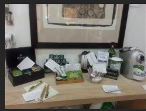
Eco photographic print. Shaving mirror with LED light. Energy efficient hair dryer. Organic and Fair Trade tea and coffee, green stationery, organic wine, homemade biscuits, jams & preserves, honey sachets, mini kettle.