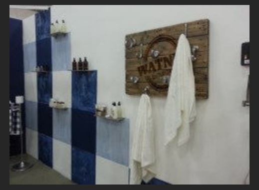
Non toxic and organic amenities and spa products in glass or PET containers on recycled aluminium shelving. Recycled paper toilet tissue. VOC reduced paint. Recycled aluminium hooks, recycled pallet wood, bamboo towels. Energy management device.