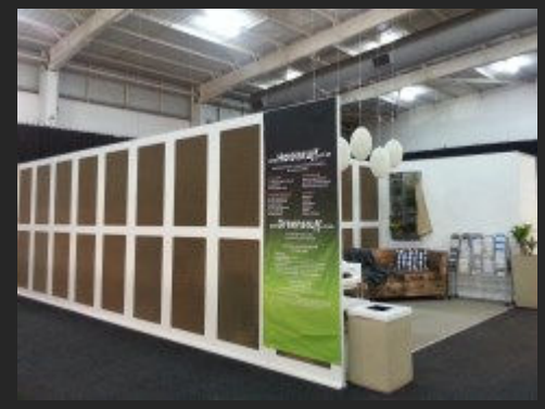
The structure panelling made from recycled perforated paper, bin and planter from recycled tyres, sisal lamps. Vertical garden. Recycled pallet bench, alpaca throw, down pillows.