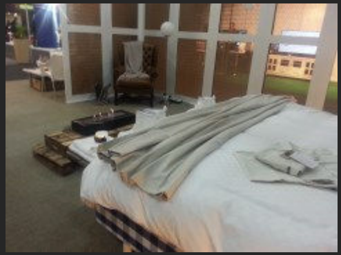
Organic cotton, hemp and flax bed linen, hemp shirt and pants, 100% natural mattress. Biofire. Eco leather wing back chair with alpaca throw. Recycled perforated paper panelling.