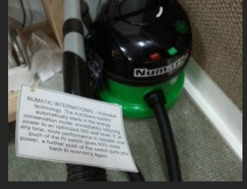
Energy saving vacuum cleaner. Every product in the guest suite had a tag with the supplier's name and green criteria.