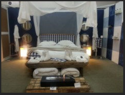
Natural carpeting, LED lighting, natural mosquito net, recycled aluminium mirror frames, bamboo bathrobes and towels, non toxic Biofire. Duck down, wool and silk duvet inners, down slippers.