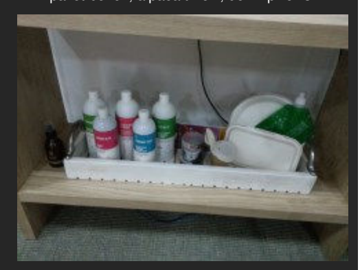
Non toxic cleaning products, biodegradable food packaging & plastic bags, recycled plastic water bag.