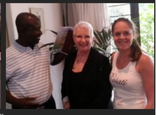
The first meeting to plan the conference in Ghana. Watch this space!

opening the event. We spoke on Green Procurement and What to Look Out For.